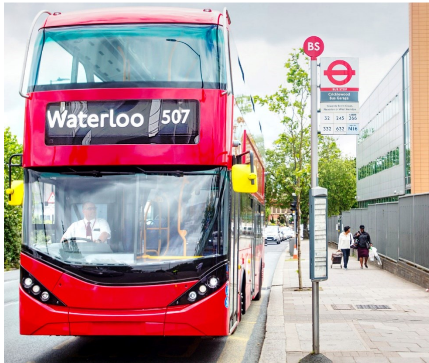
A Navaho Transport systems destination blind on the ADL Enviro 400 EV

Nominate a marketing contact who will be included in the editor's monthly process of 'chivvyng'.